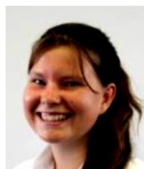
Alivia Goldfinch Scholarship: Geography 2018: Massey University Environmental Science and Geography