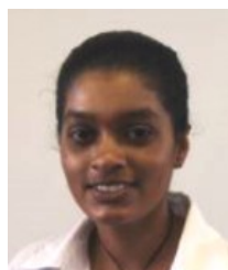
Sanjeshni Singh-Ruru Scholarship: Photography 2018: Victoria University Commerce