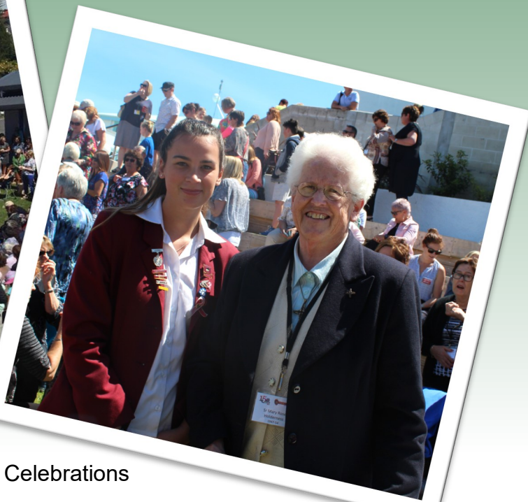
150th Jubilee Celebrations