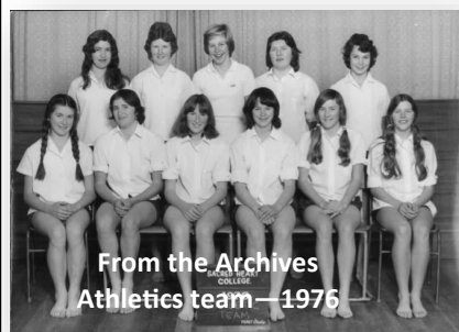
From the Archives Athletics team—1976