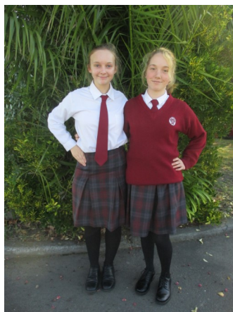
Year 13 Winter uniform