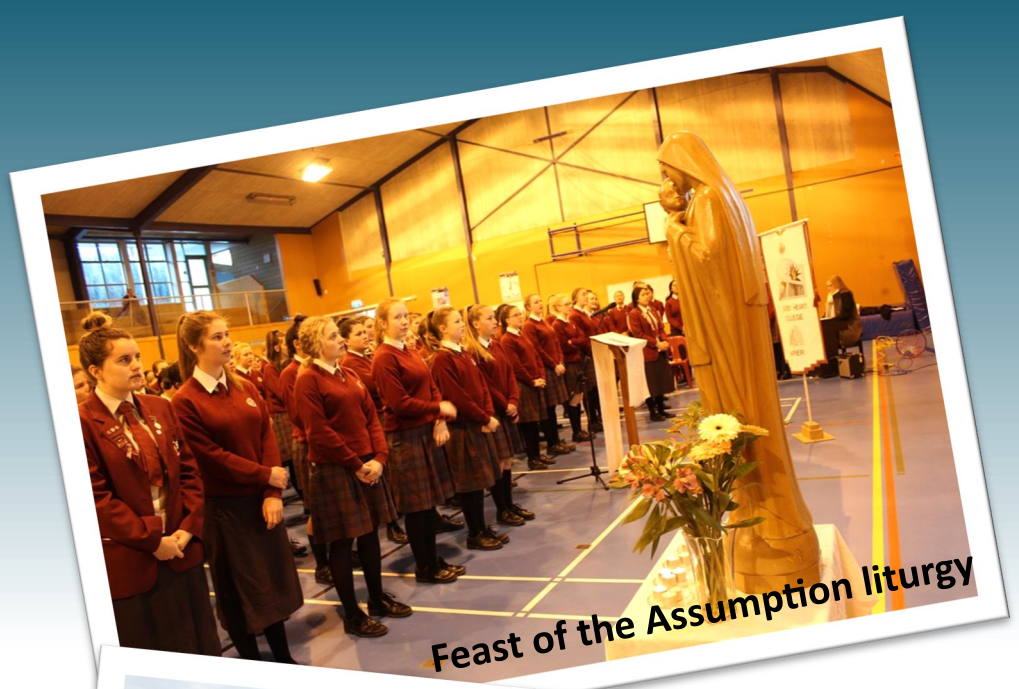
Feast of the Assumption liturgy