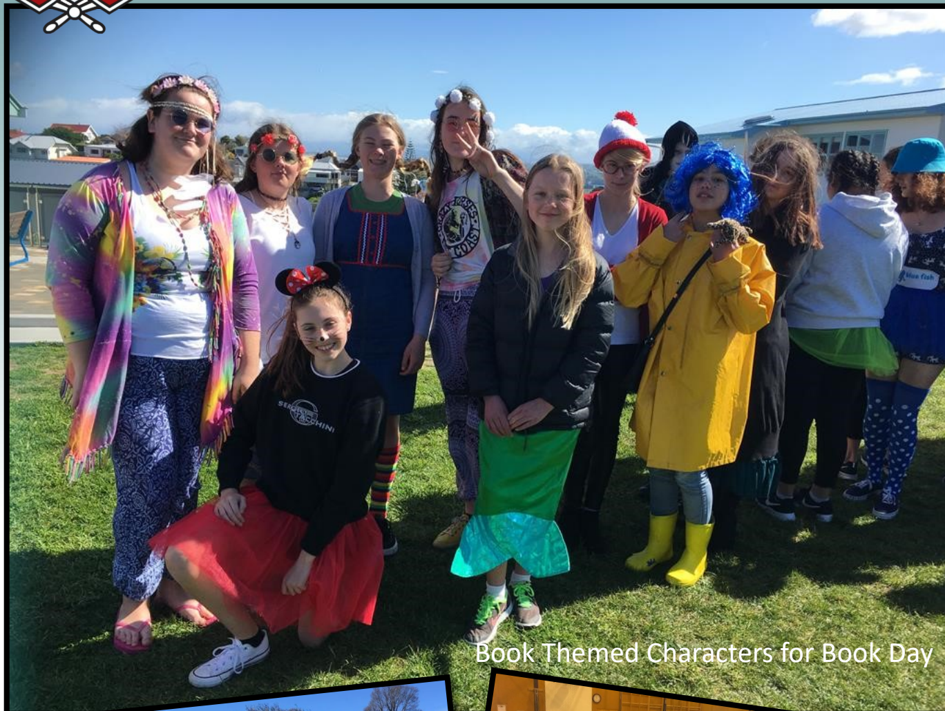
Book Themed Characters for Book Day