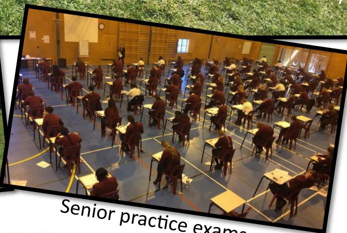
Senior practice exams