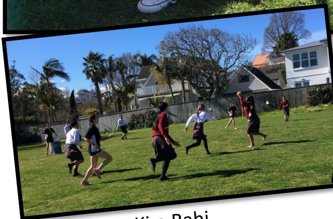
Ki o Rahi